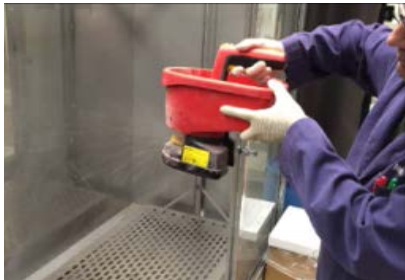
Zyrox® Fly Granular Bait

Zyrox was developed with the applicator in mind. The formulation was designed to produce no odorous smell or dusting during application, making Zyrox an ideal choice for application over other competing granular fly baits.