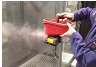
QuickBayt® Fly Bait